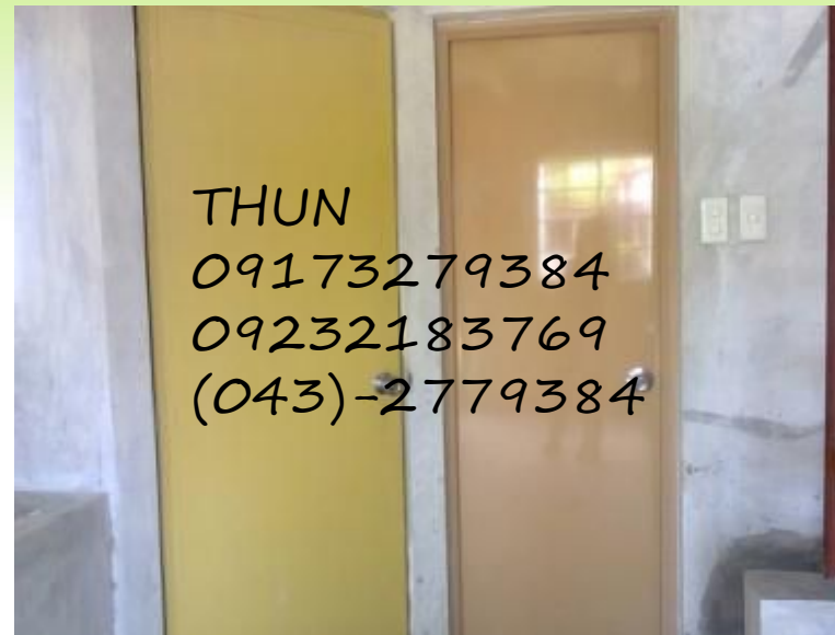
FLUSH DOOR PVC DOOR

THUN 09173279384 09232183769 (043)-2779384