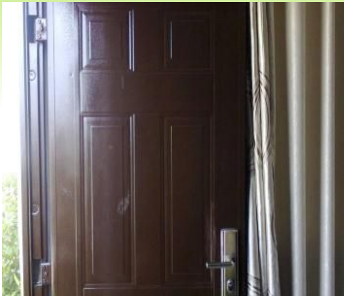
Main Door – STEEL